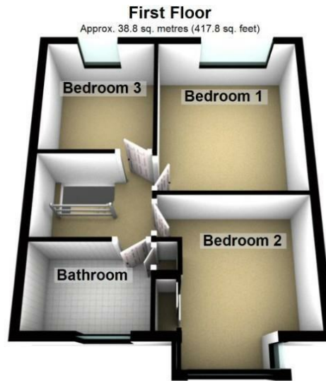
First Floor Approx. 38.8 sq. metres (417.8 sq. feet)

Total area: approx. 108.5 sq. metres (1168.0 sq. feet)