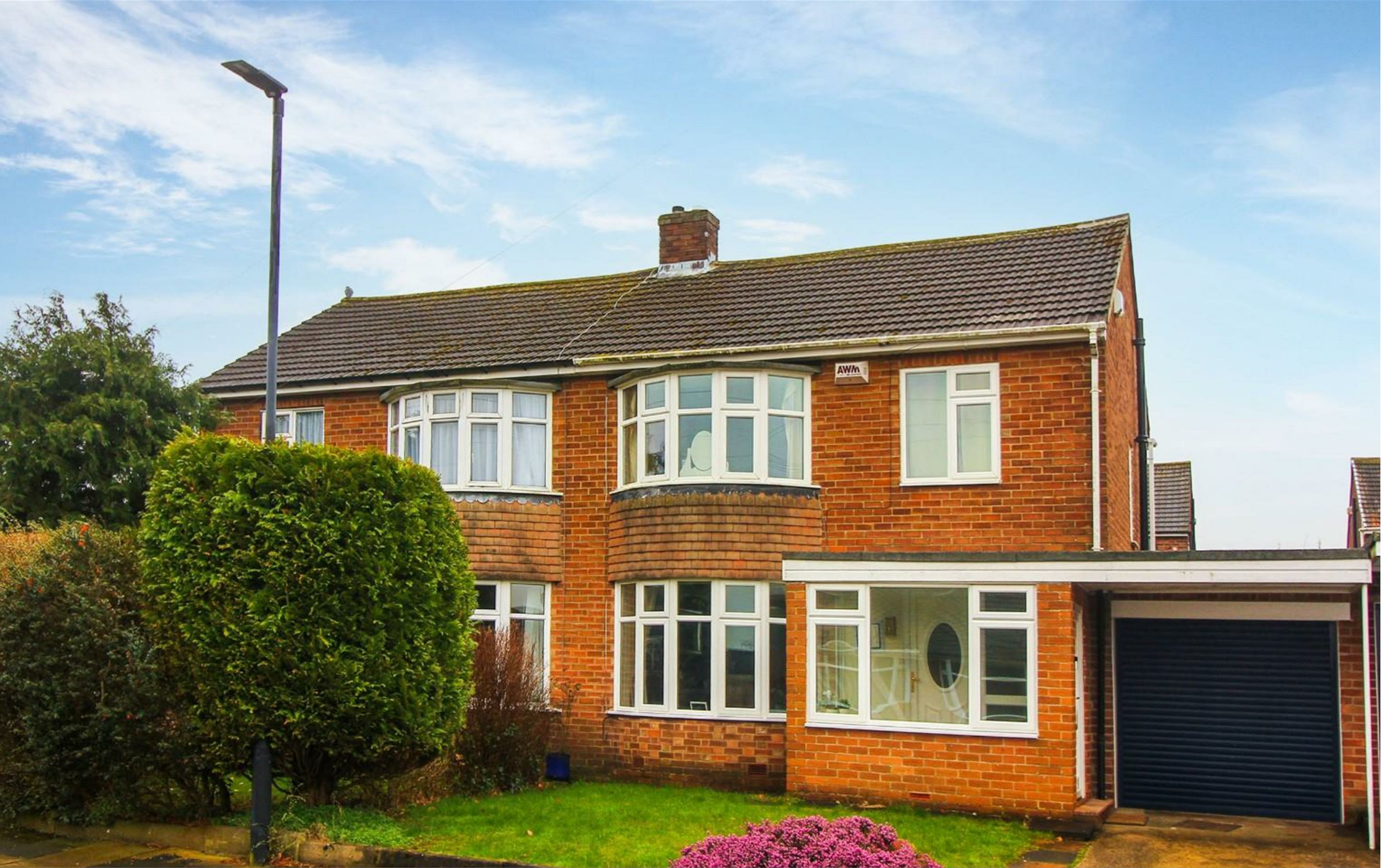
📍 Woodhorn Gardens, Newcastle Upon Tyne NE13 6AG