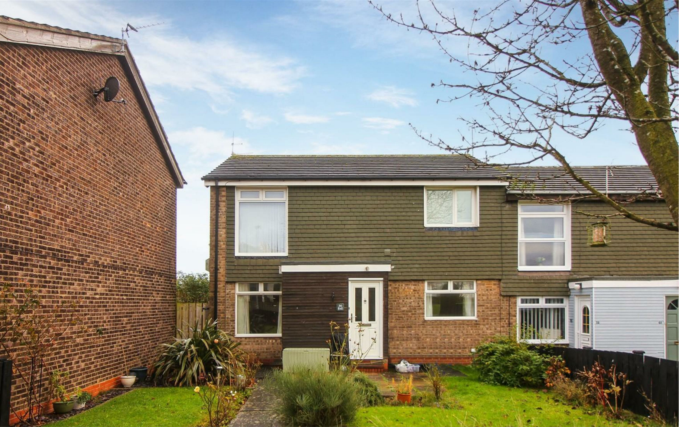
📍 Newburgh Avenue, Whitley Bay NE25 0JW