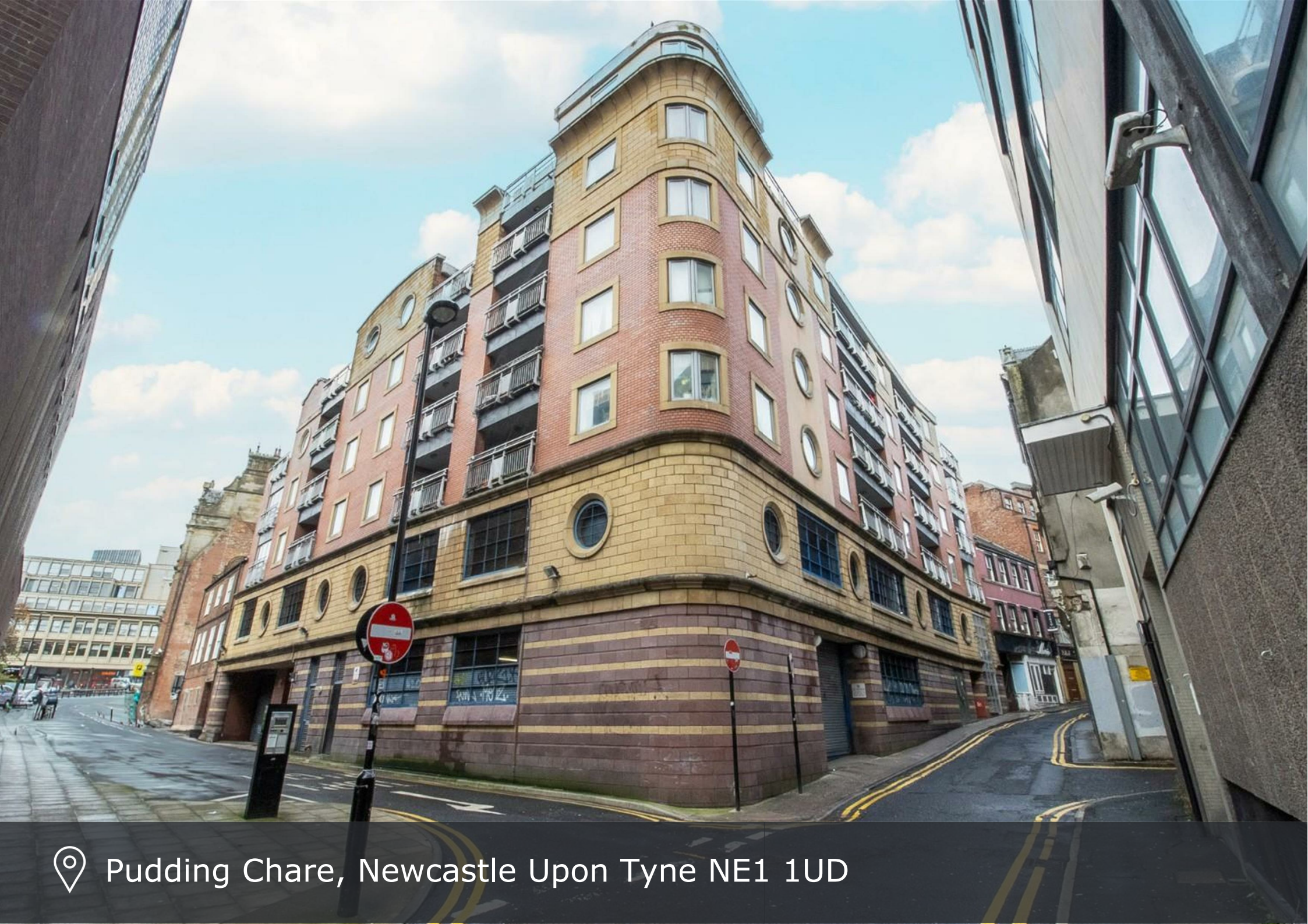
📍 Pudding Chare, Newcastle Upon Tyne NE1 1UD