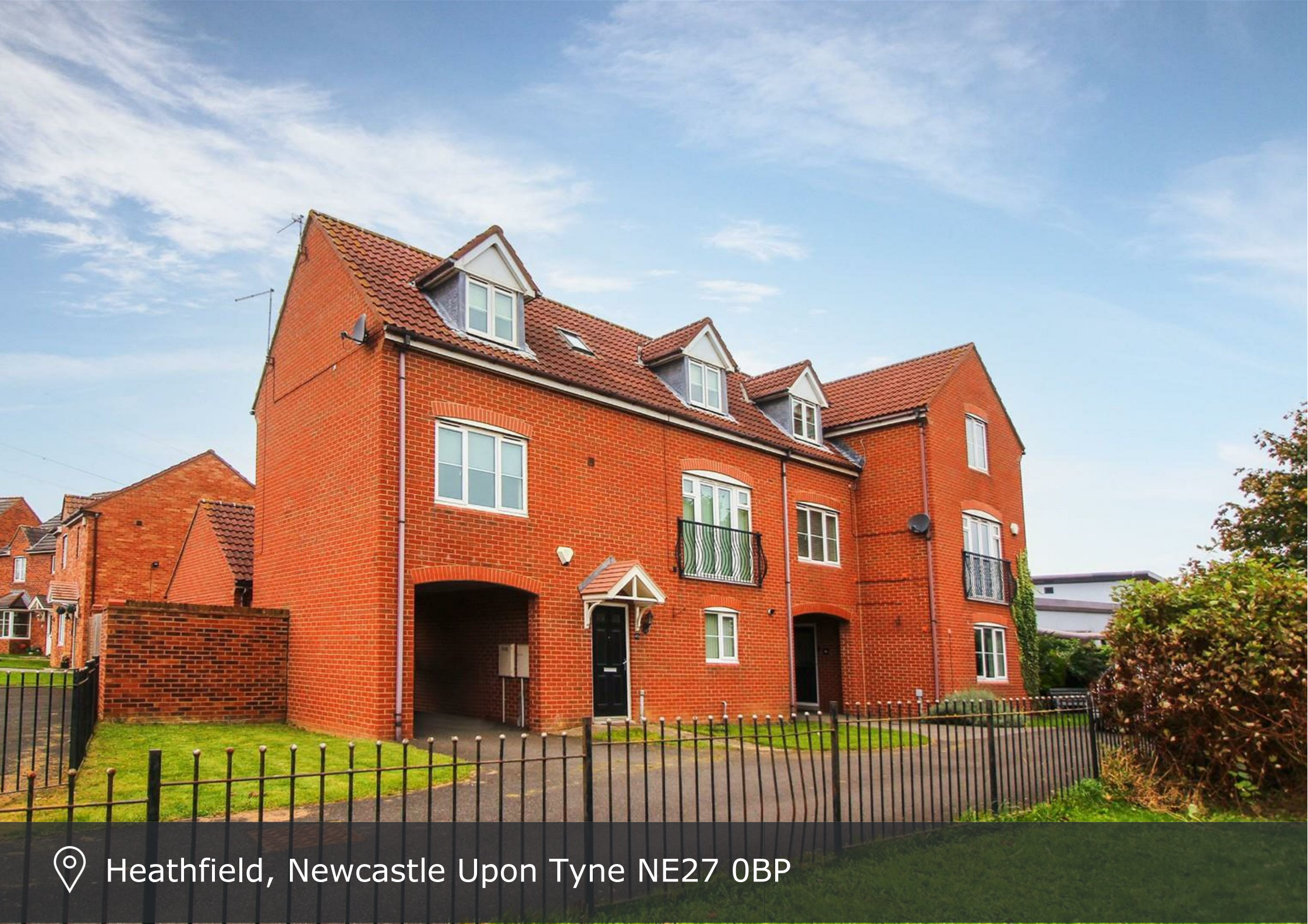
📍 Heathfield, Newcastle Upon Tyne NE27 0BP