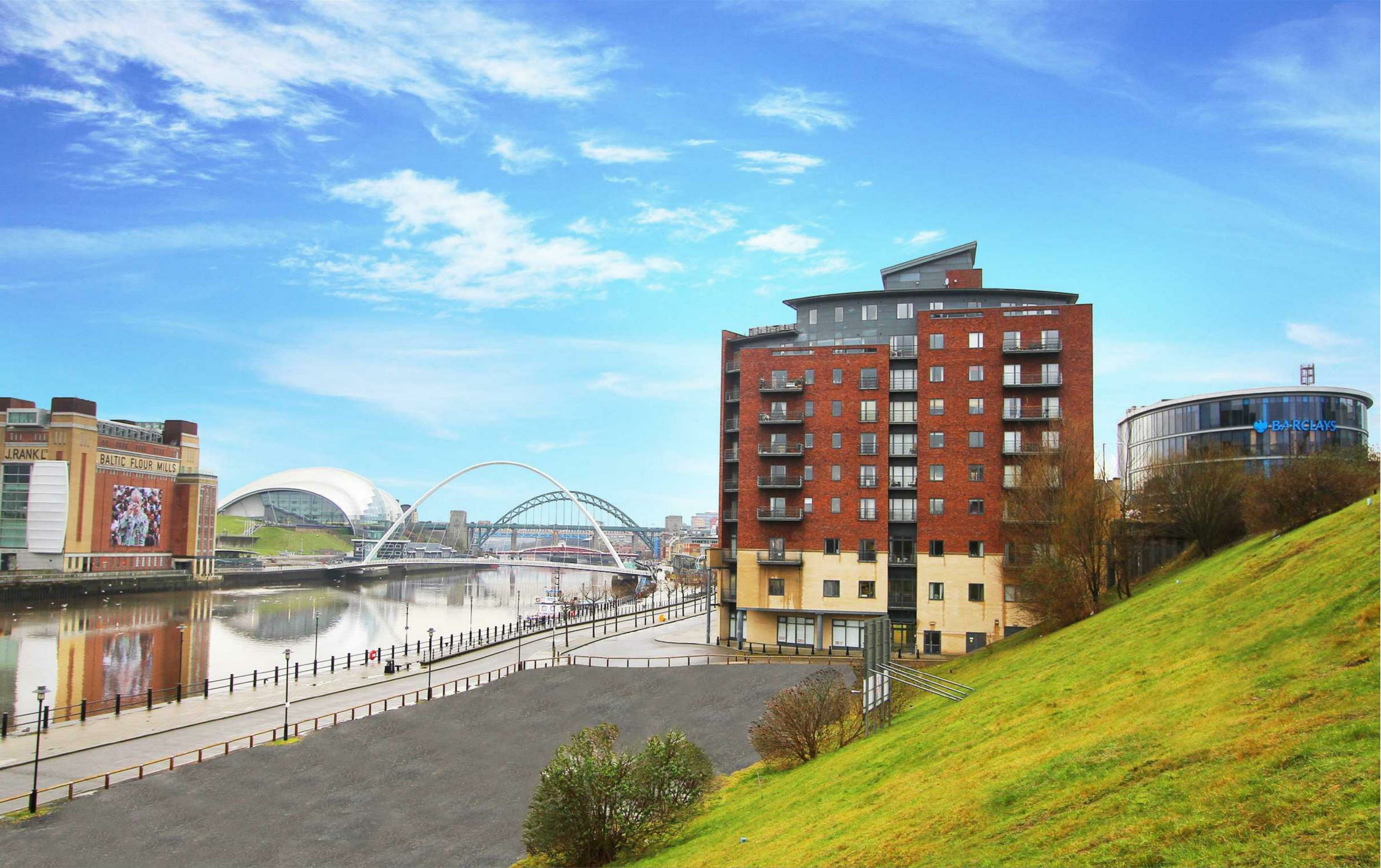
📍 St. Anns Quay, Quayside NE1 3BB