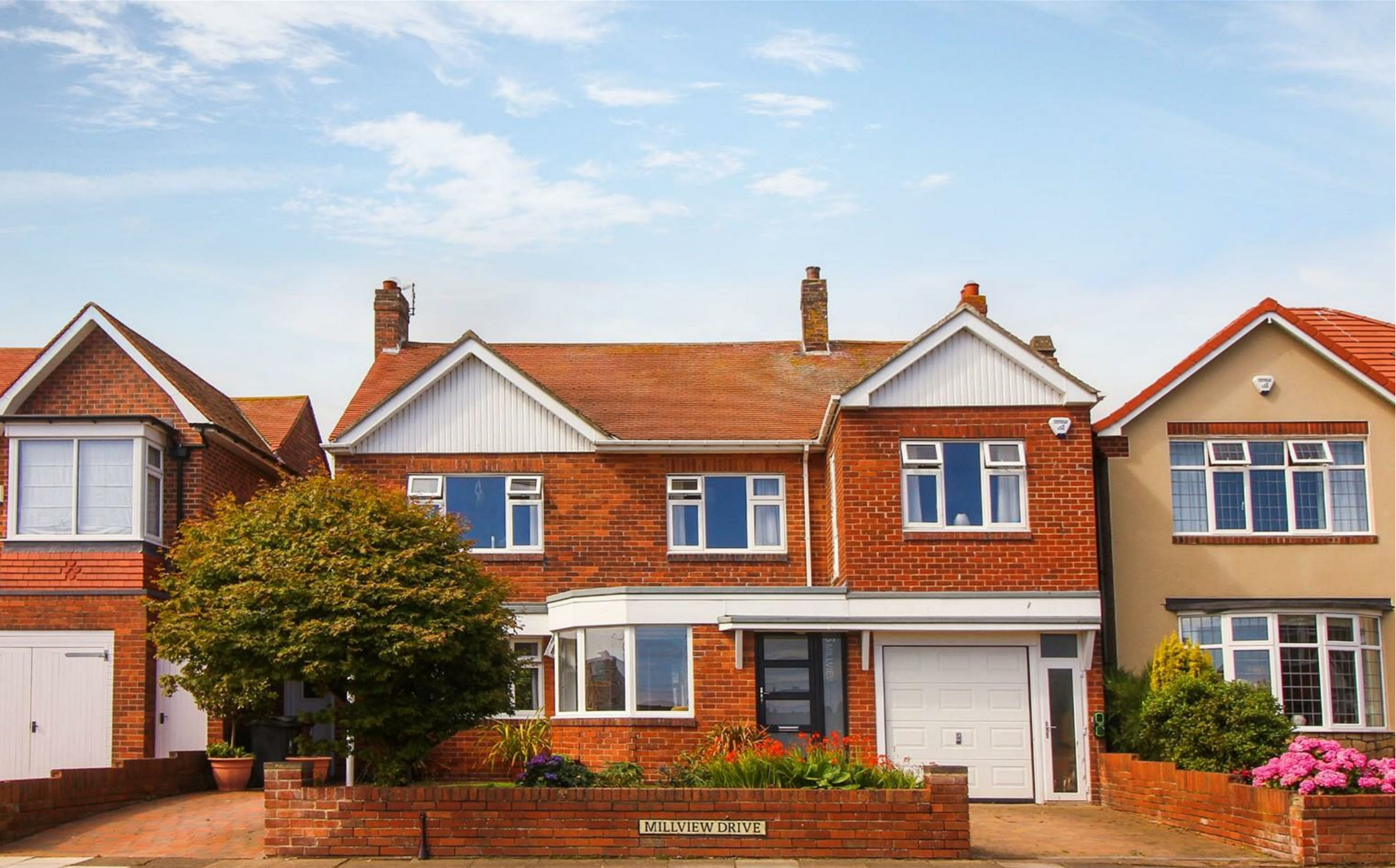
📍 Millview Drive, Tynemouth NE30 2QD