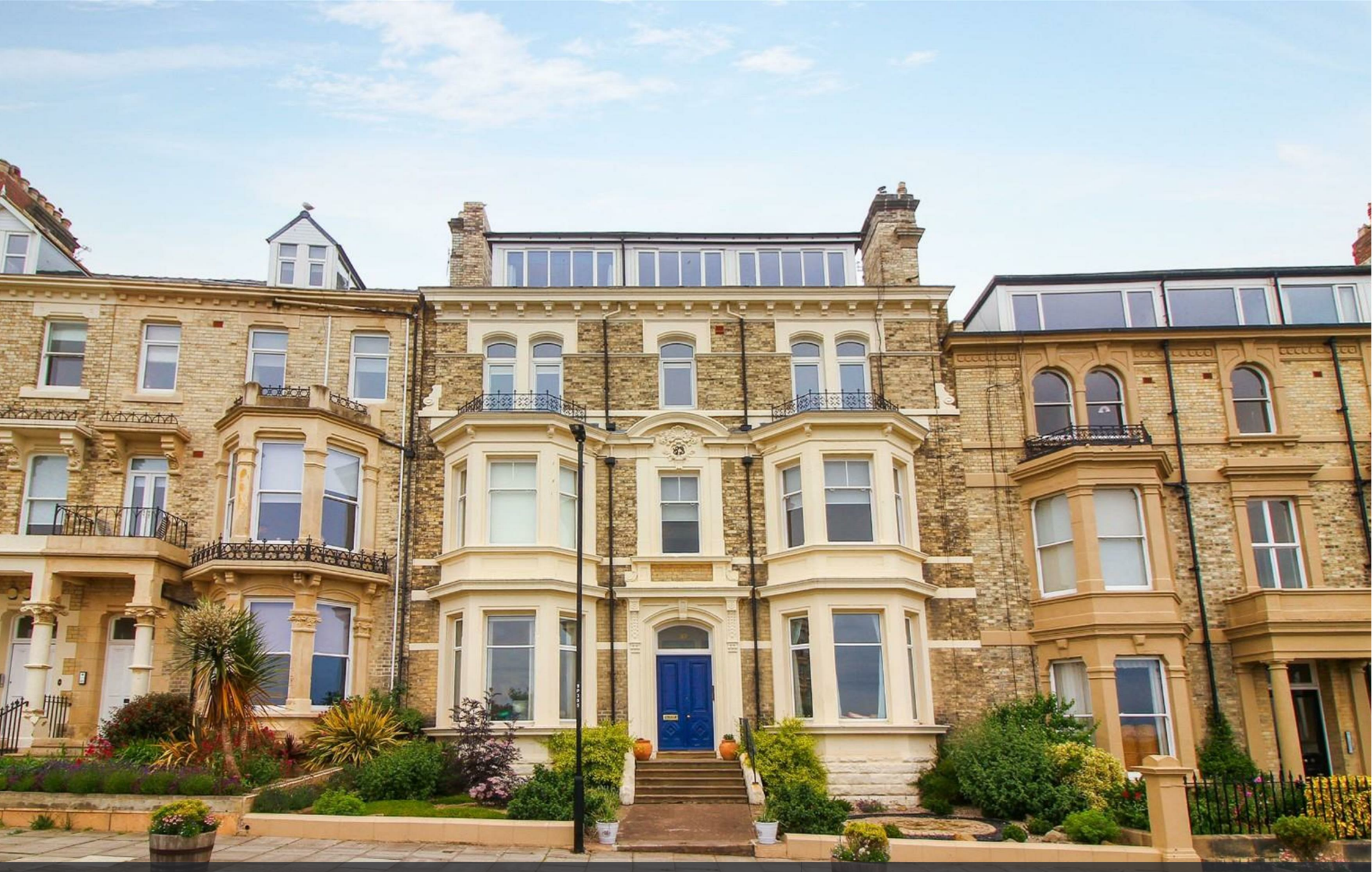
📍 Percy Gardens, North Shields NE30 4HQ