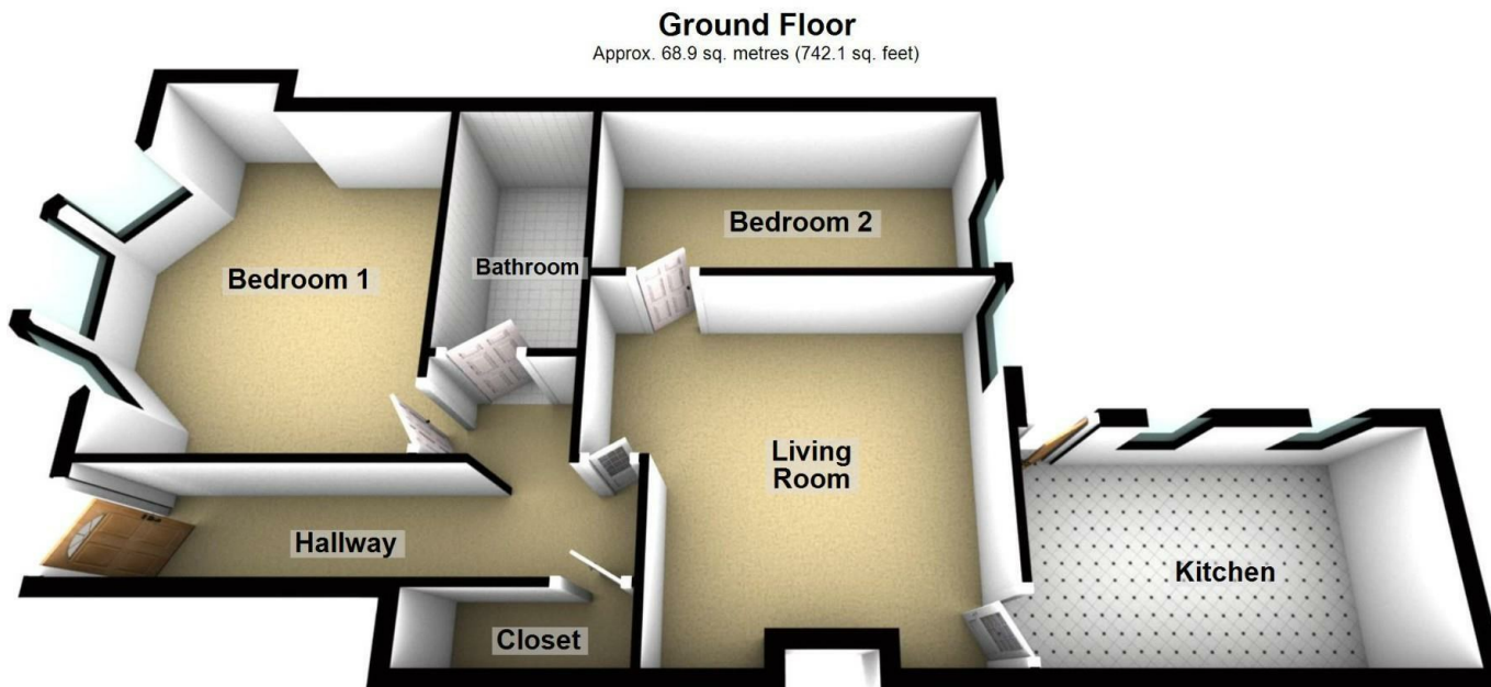
Ground Floor Approx. 68.9 sq. metres (742.1 sq. feet)

Total area: approx. 68.9 sq. metres (742.1 sq. feet)