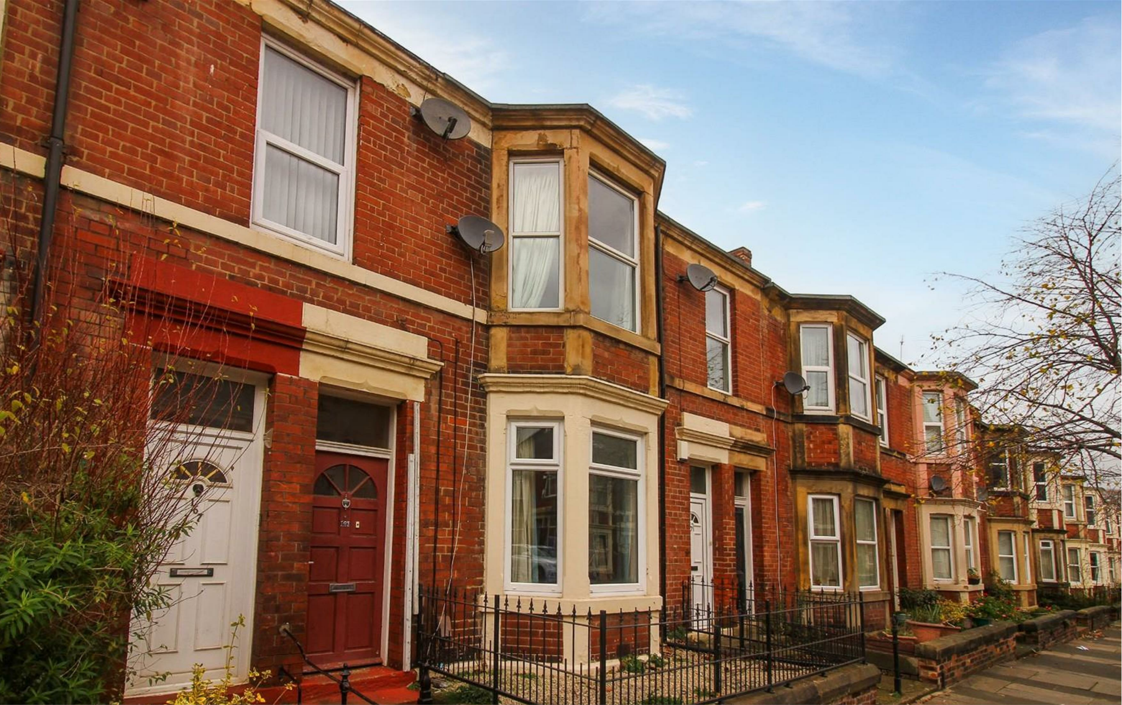
📍 Helmsley Road, Newcastle Upon Tyne NE2 1RD