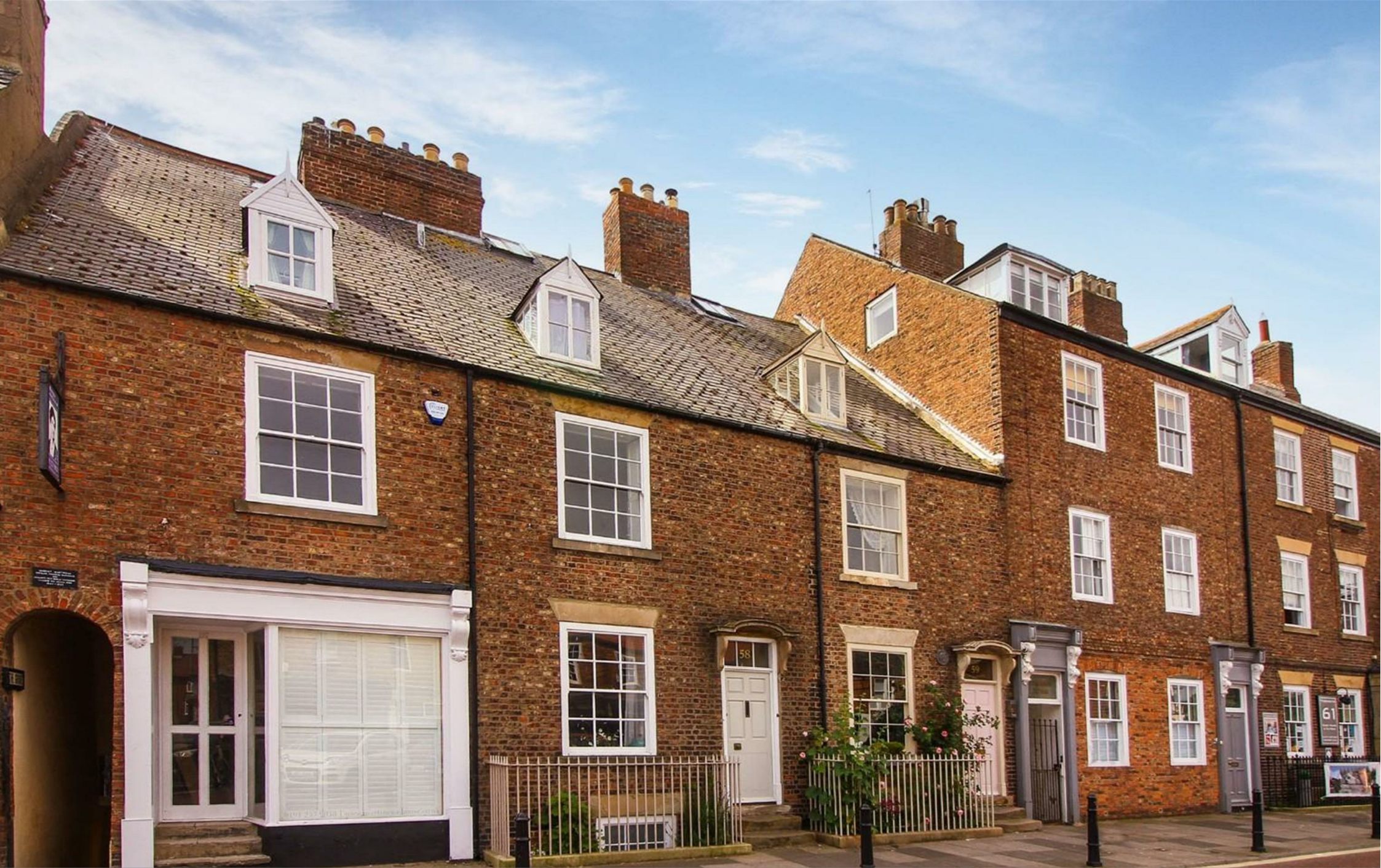
📍 Front Street, North Shields NE30 4BX