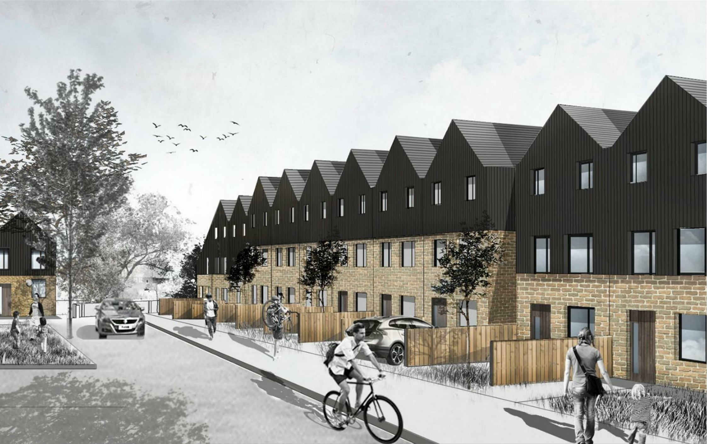
📍 Low Lights Development, North Shields NE30 1AR