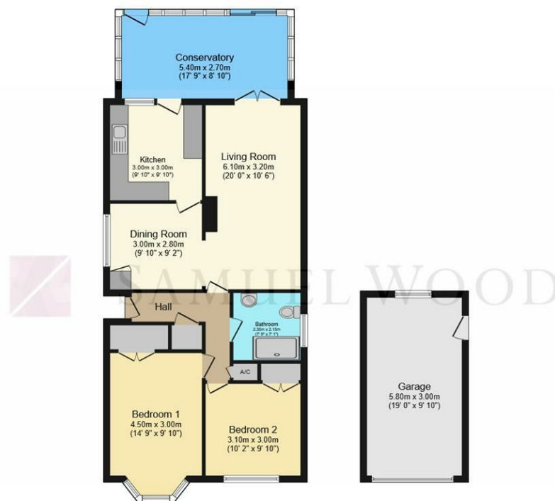
Floor Plan Floor area 90.5 sq.m. (974 sq.ft.)