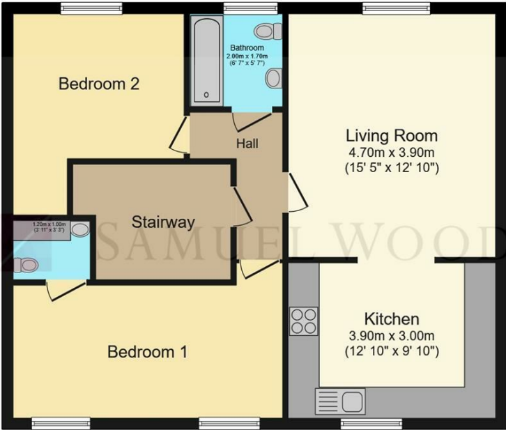
Floor Plan Floor area 66.3 m 2 (713 sq.ft.)