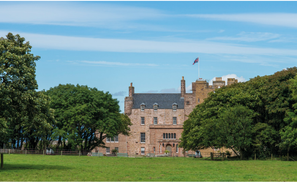
Castle of Mey and Harrow Harbour