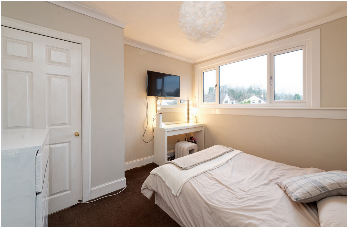
The upstairs accommodation houses three additional airy bedrooms and a modern, high-spec family bathroom.