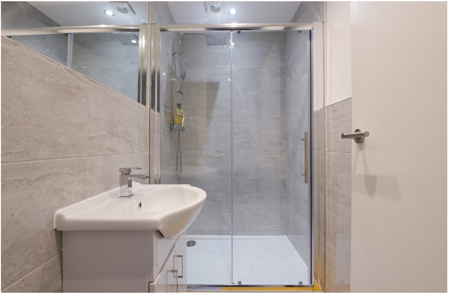
The bathroom exudes quality, with chic tiling, a large walk-in shower and a luxurious waterfall shower. A separate WC with attractive panelling adds further style and convenience.