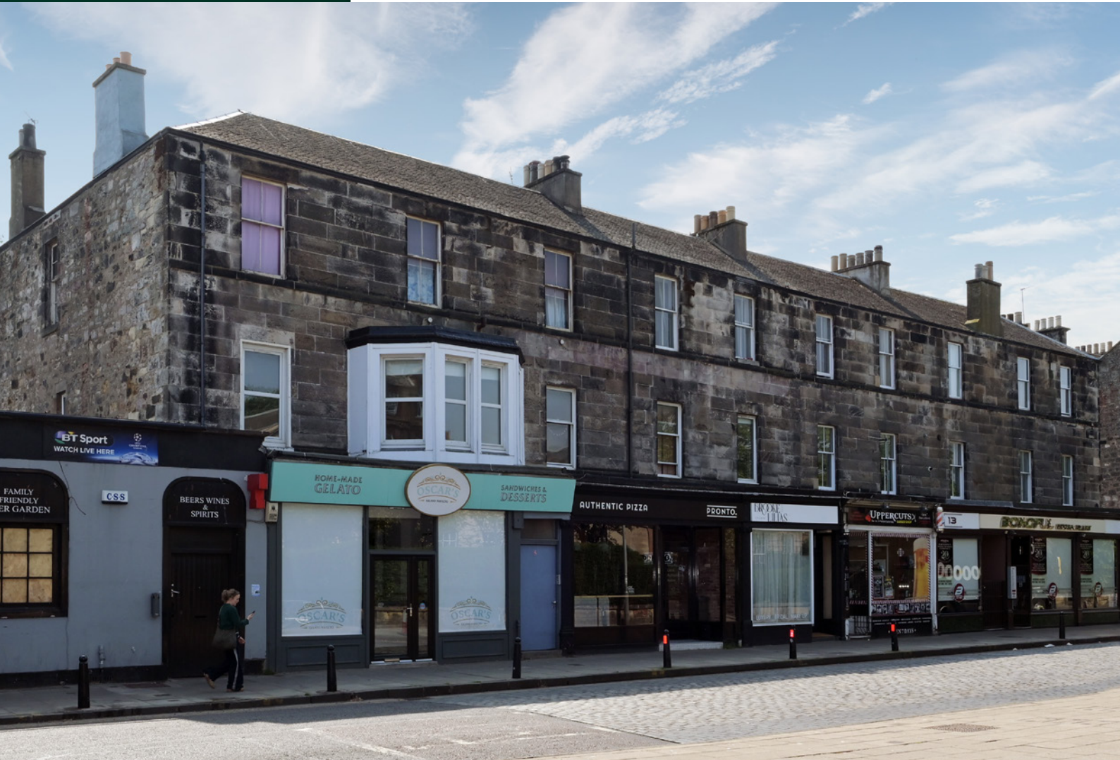
Spacious Two-Bedroom First-Floor Flat In Portobello