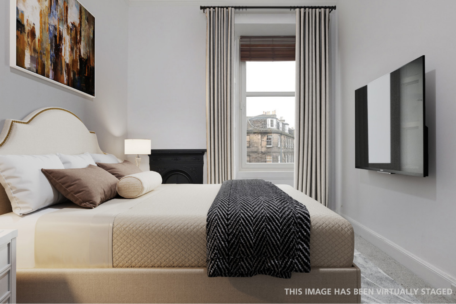
THIS IMAGE HAS BEEN VIRTUALLY STAGED