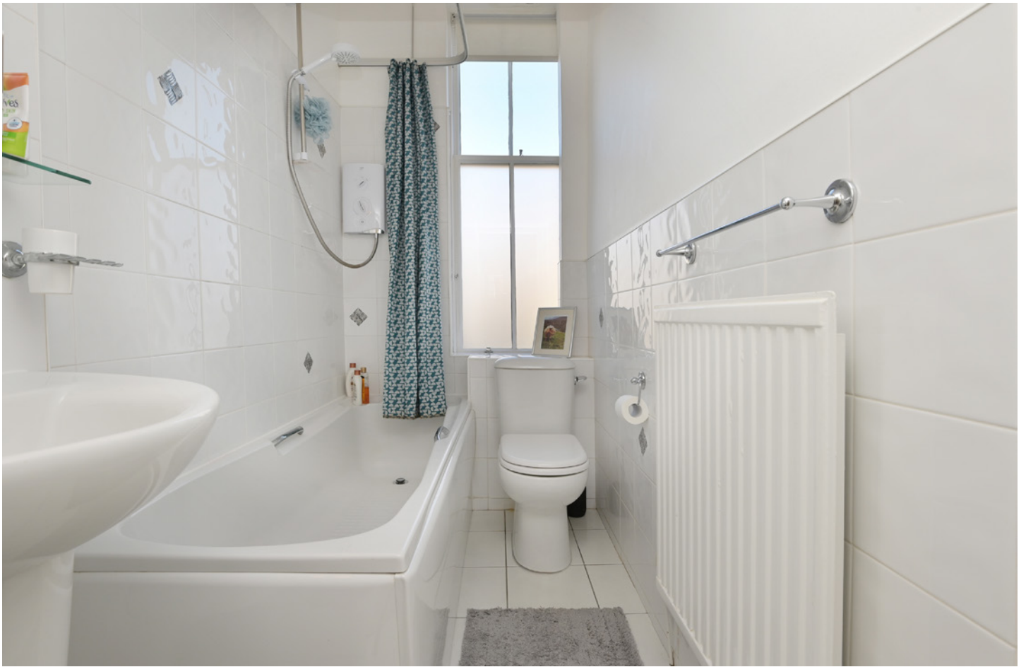
The bathroom is fitted with a three-piece bathroom suite with an electric shower over the bath.