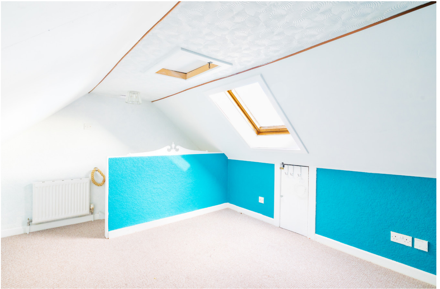
Venturing upstairs reveals an additional attic room, accessible via stairs in the hall, and a fourth official bedroom, positioned above the study.