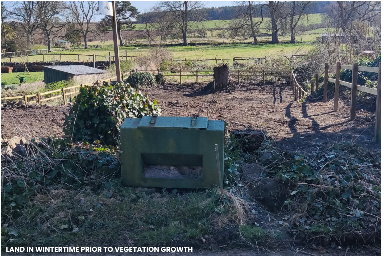
LAND IN WINTERTIME PRIOR TO VEGETATION GROWTH