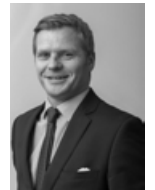
Layout graphics and design ALAN SUTHERLAND Designer