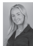
Professional photography ERIN MCMULLAN Photographer