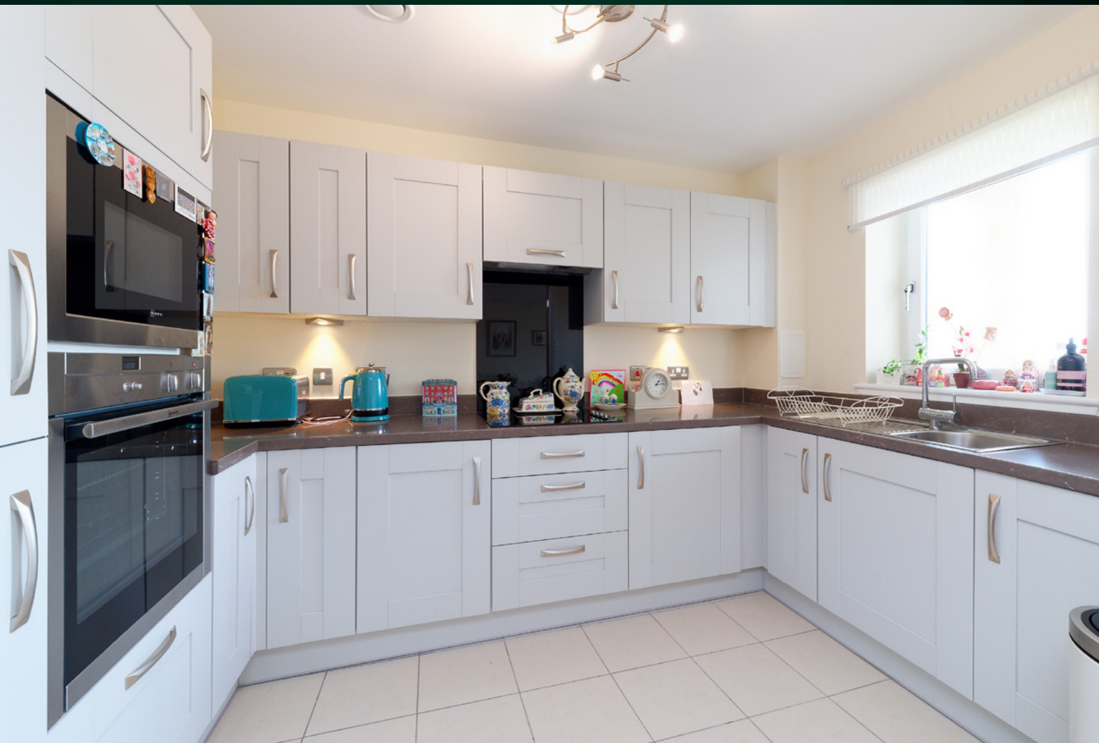
Stylish kitchen with a range of floor and wall-mounted cabinets and integrated NEFF appliances.