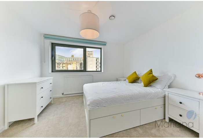
Bedroom 2 13'3" x 10'9" (4.06 x 3.3)