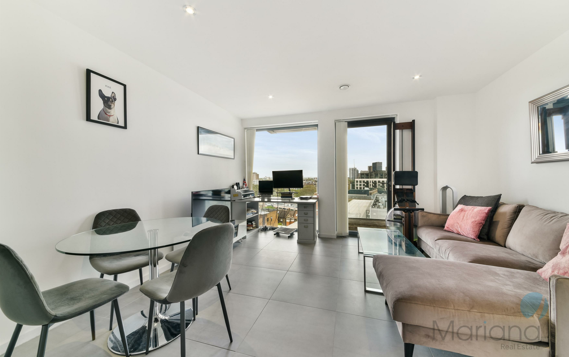
40 Rosler Building London Bridge, London SE1 0FT £575 Per Week