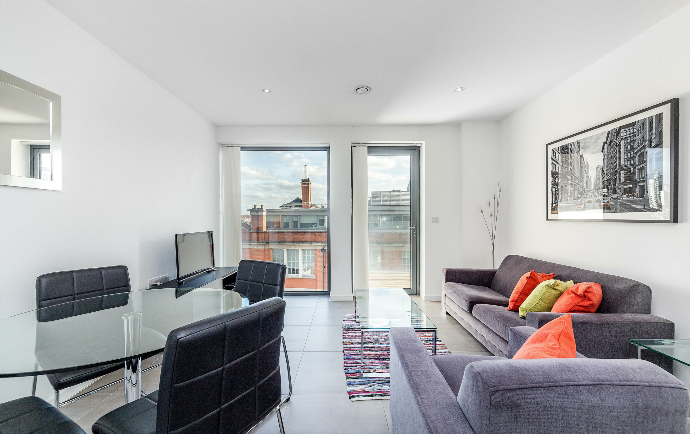
22 Rosler Building London Bridge, London SE1 0FT £575 Per Week