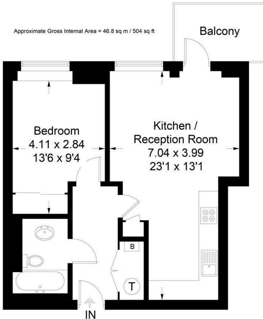
Illustration for identification purposes only, measurements are approximate, not to scale. floorplansUsketch.com © (ID404507)

Approximate Gross Internal Area = 46.8 sq m / 504 sq ft