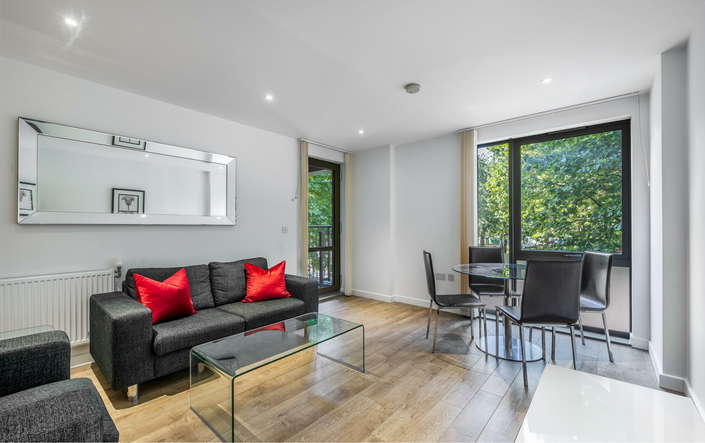
8 Palm House London, SE11 5AH £500 Per Week