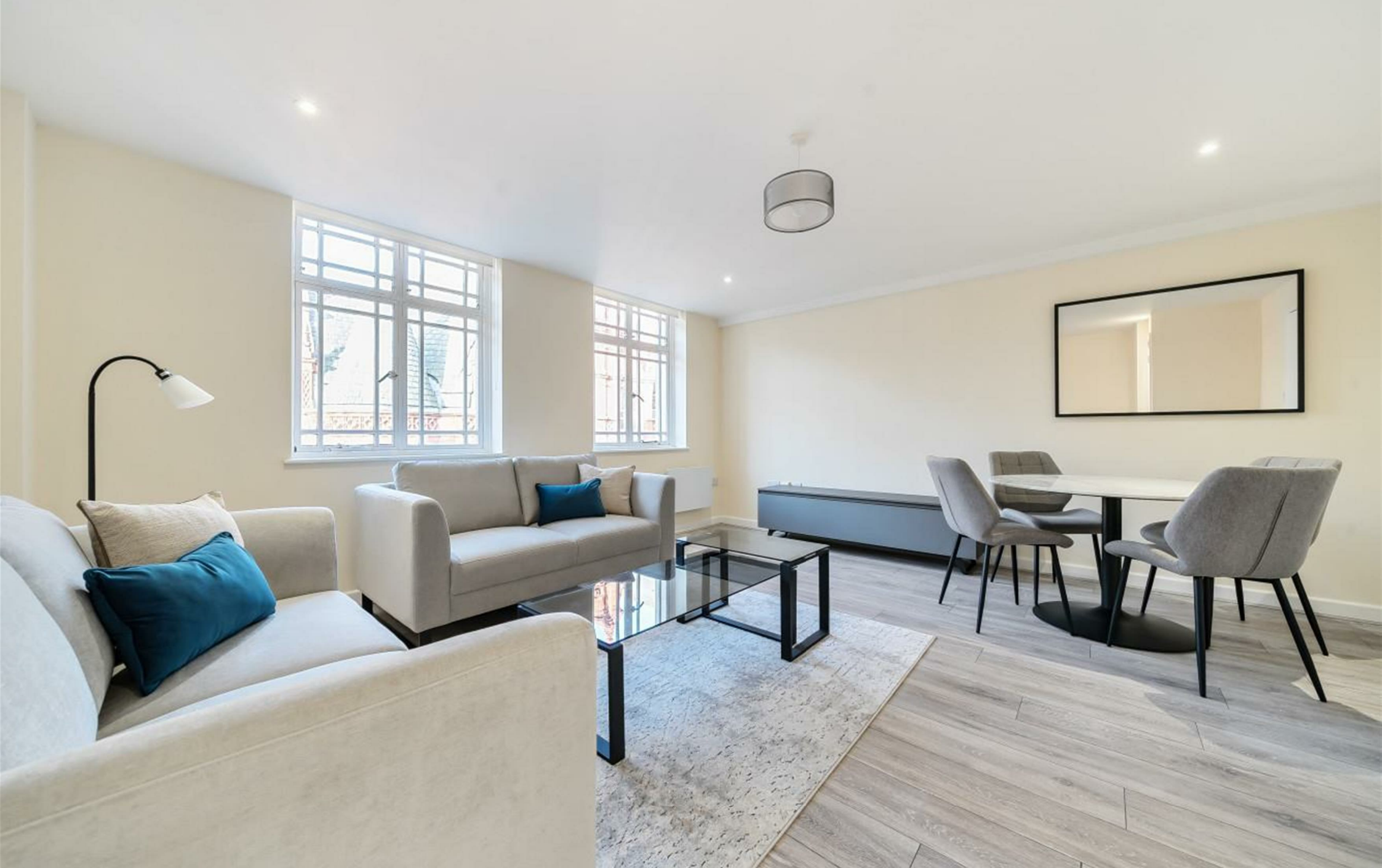
Flat 13 Chatfield House, Marsh Street Bristol, BS1 1RT £1,800 Per Month