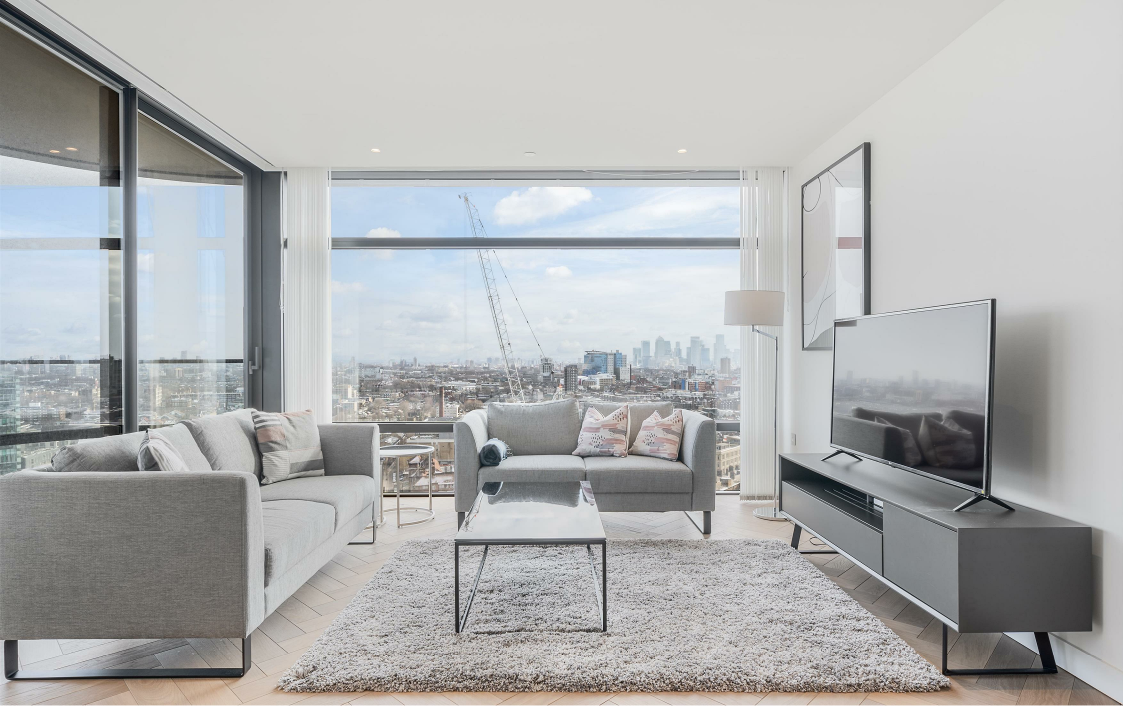
2004 Principal Tower Worship Street, London EC2A 2FE £1,150 Per Week