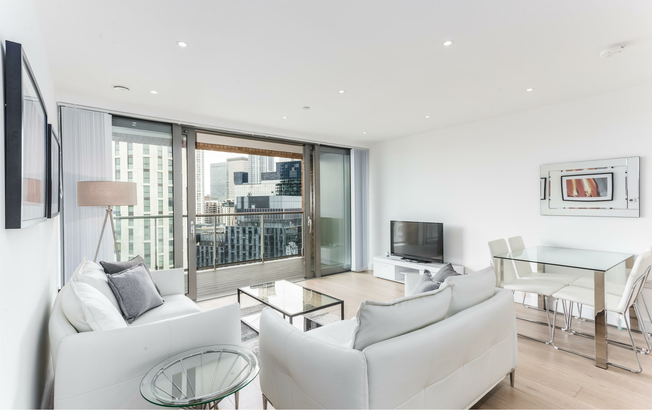
1607 Heritage Tower, The Liberty Building, East Ferry R London, E14 3LL £2,500 Per Month