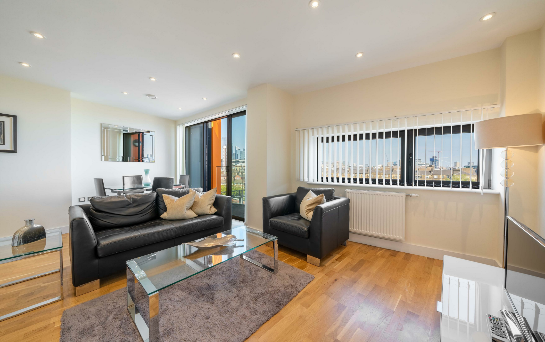
126 Arc House Tower Bridge, London SE1 3GP £2,300 Per Month