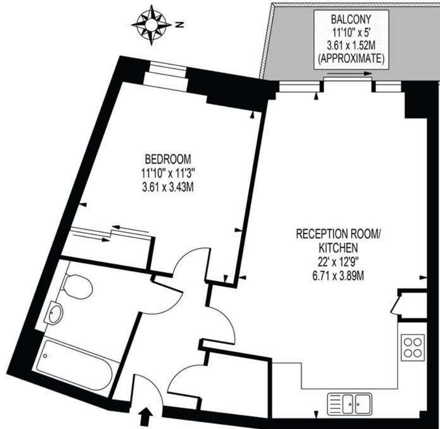
FOURTH FLOOR FOR ILLUSTRATION PURPOSES ONLY

APPROXIMATE GROSS INTERNAL FLOOR AREA: 523 SQ FT - 48.59 SQ M