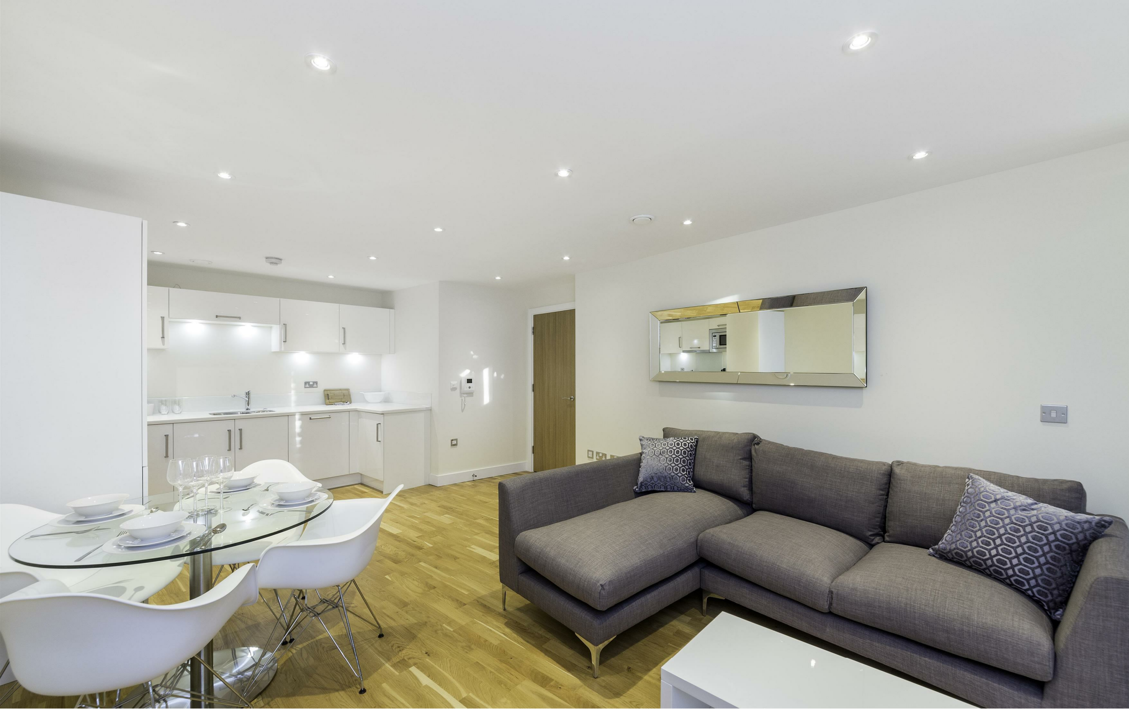
97 Arc House Tower Bridge, London SE1 3GP £525 Per Week