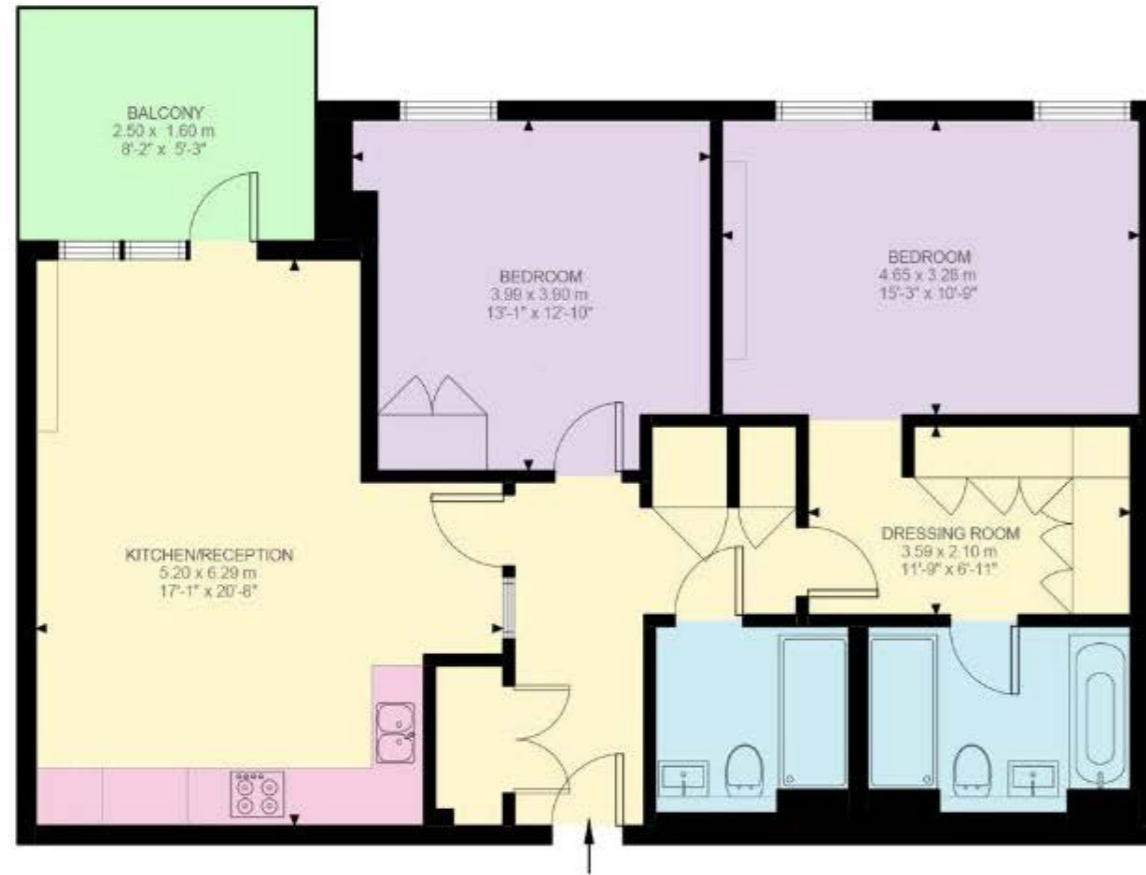
Ground Floor 982 ft 2

Approximate Gross Internal Area = 91.26 sq m / 982 sq ft