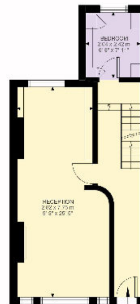
Raised Ground Floor 449 sq ft