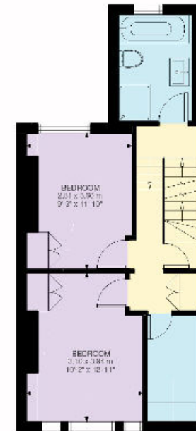
First Floor 459 sq ft