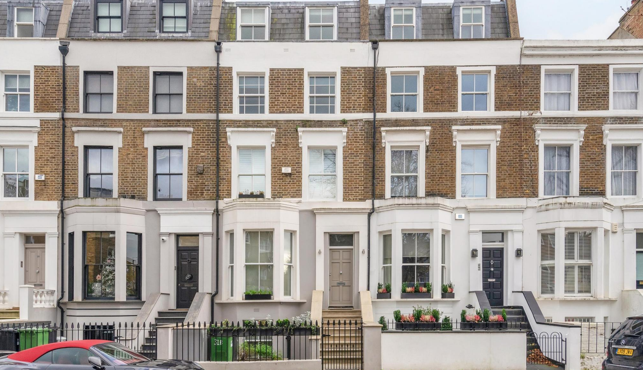
Moore Park Road, London SW6