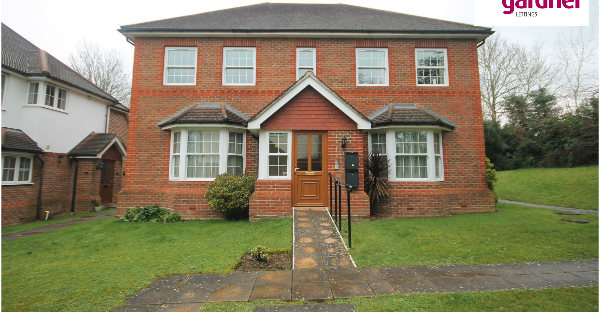
Woodville Court, Woodvill Road, Leatherhead, KT22 7BJ