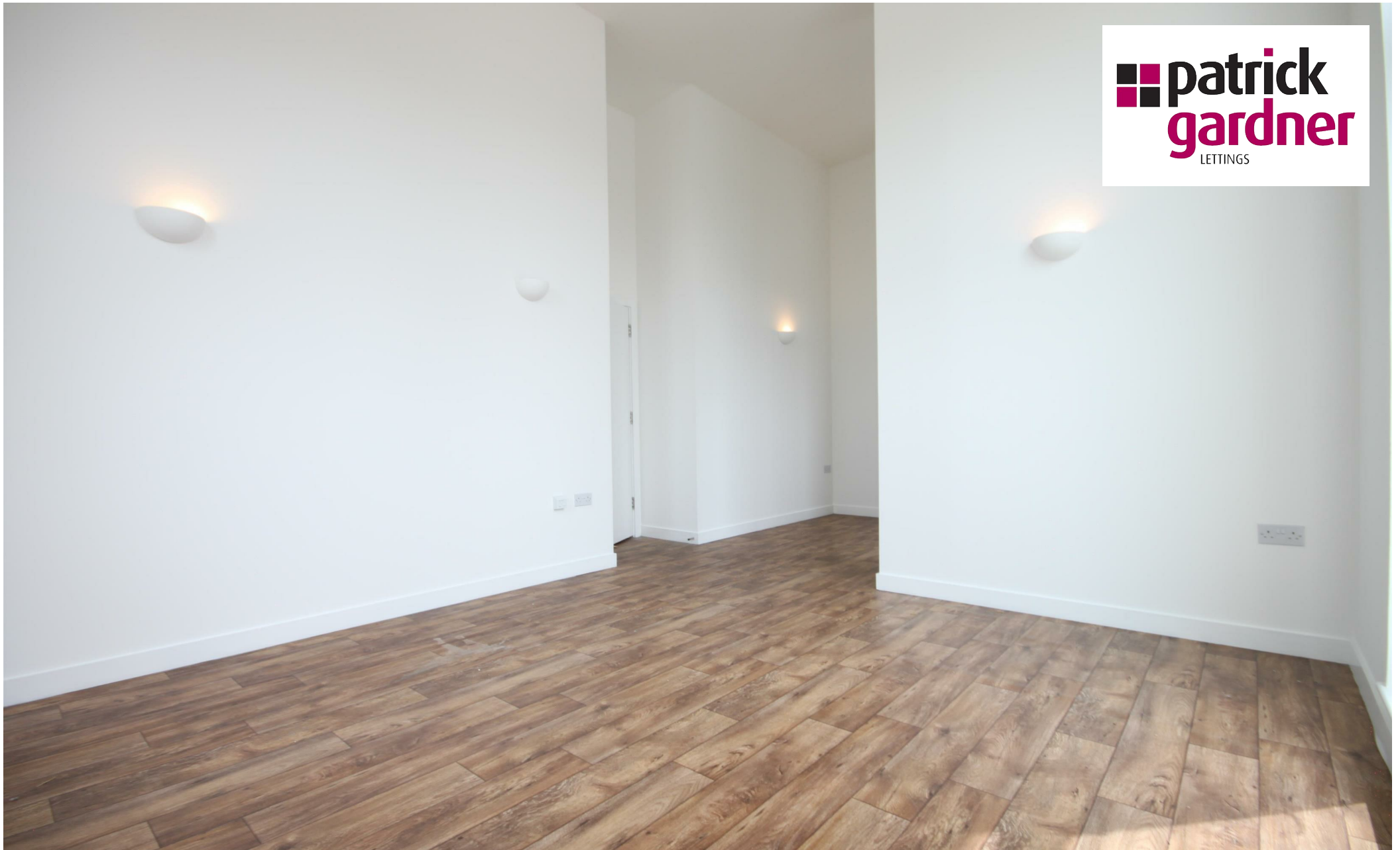
Cedar House, Park View Road, Leatherhead, KT22 7GB