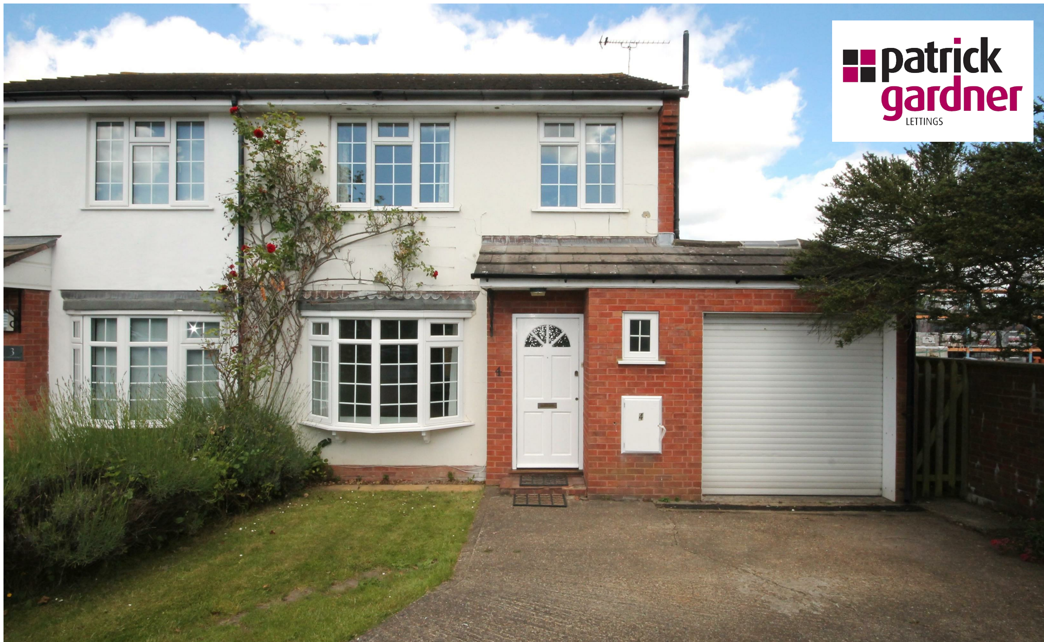
The Withies, Leatherhead, KT22 7EY