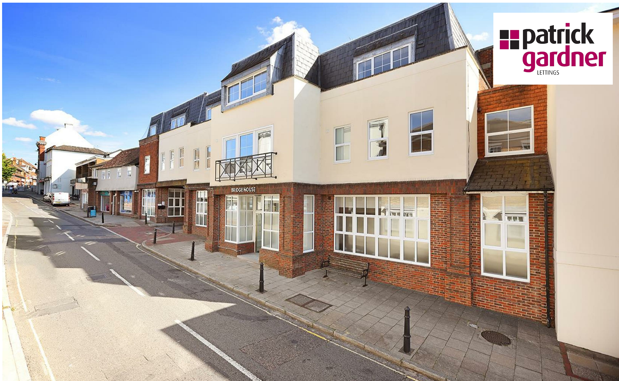
Bridge House, Bridge Street, Leatherhead, KT22 8HE