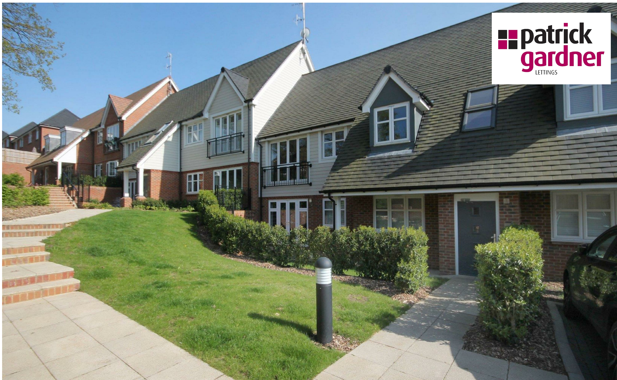
Flat 1, 34 Consort Drive, Leatherhead, KT22 0AS