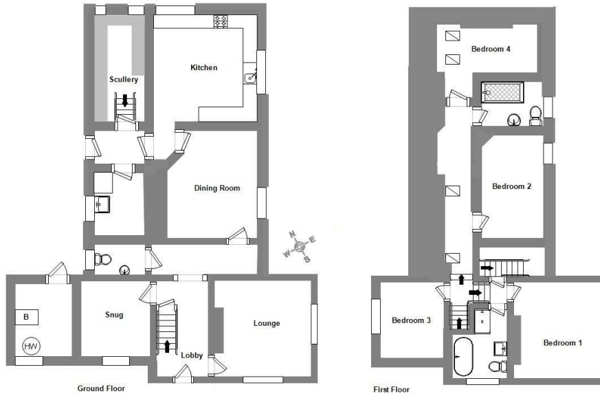
Kemps Green Farm Nuthurst Lane Hockley Heath Birmingham B94 5PR

Lounge 4.57m x 4.53m Snug 3.75m x 3.63m Lobby 2.56m x 4.58m Dining Room 3.96m x 4.75m Kitchen 4.29m x 4.72m Scullery 2.31m x 4.75m Bedroom 1 4.55m x 4.54m Bedroom 2 3.24m x 4.66m Bedroom 3 3.71m x 3.60m Bedroom 4 4.36m x 3.71m