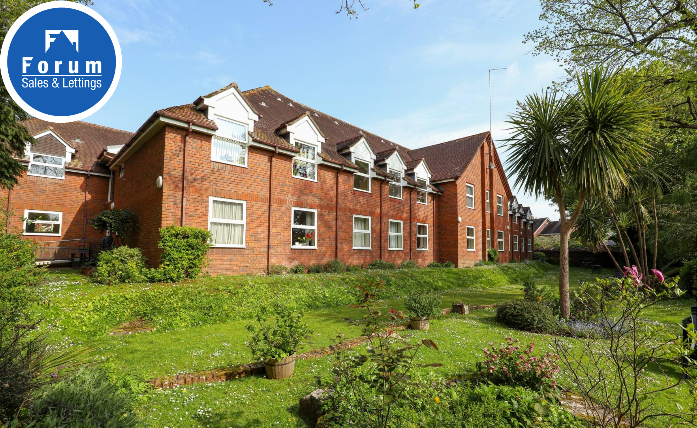
Flat 6 Chestnut House, East Street, Blandford Forum, Dorset, DT11 7DU