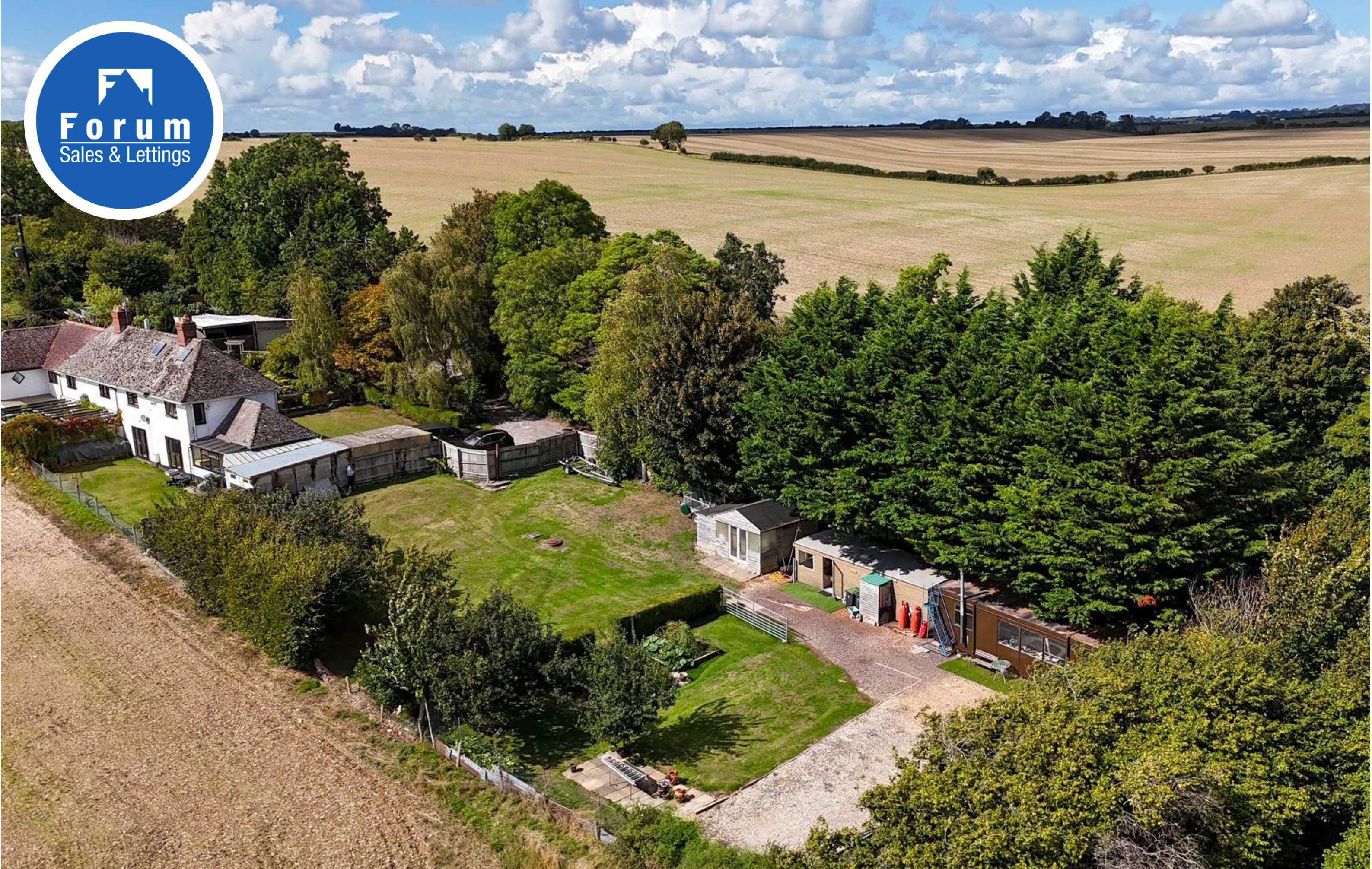
1 Longmead Cottages, Milborne St Andrew, Dorset, DT11 0HU