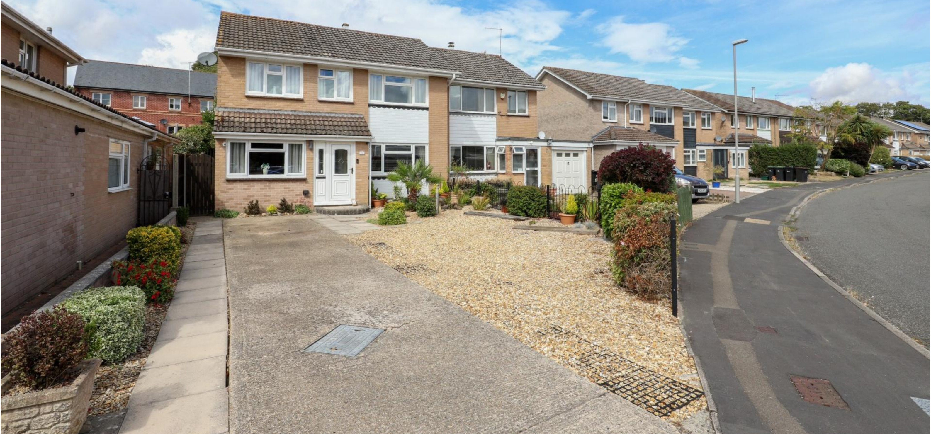
53 Downside Close, Blandford Forum, Dorset, DT11 7SD