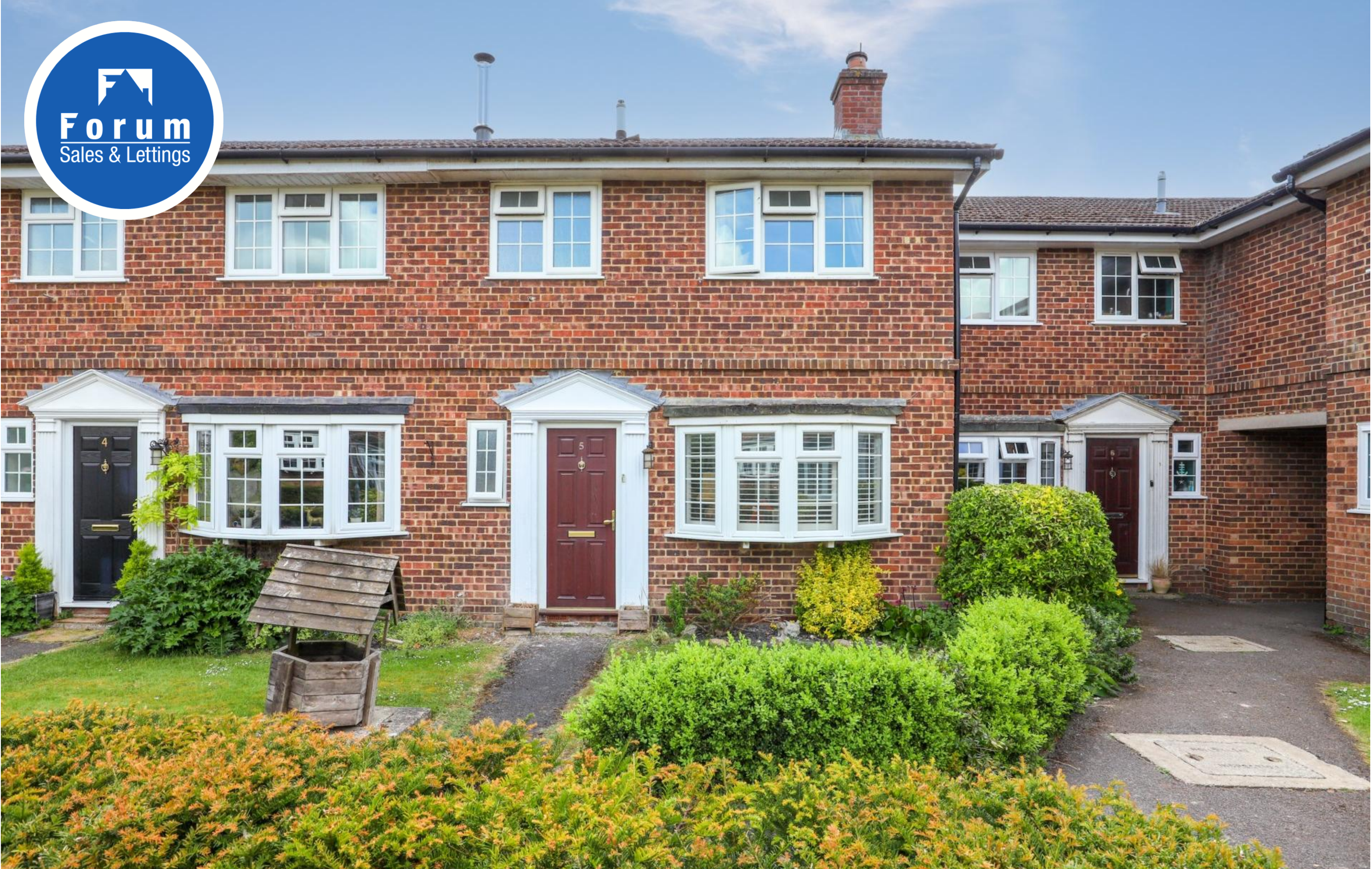
5 St Marys Court, Sixpenny Handley, Salisbury, Wiltshire, SP5