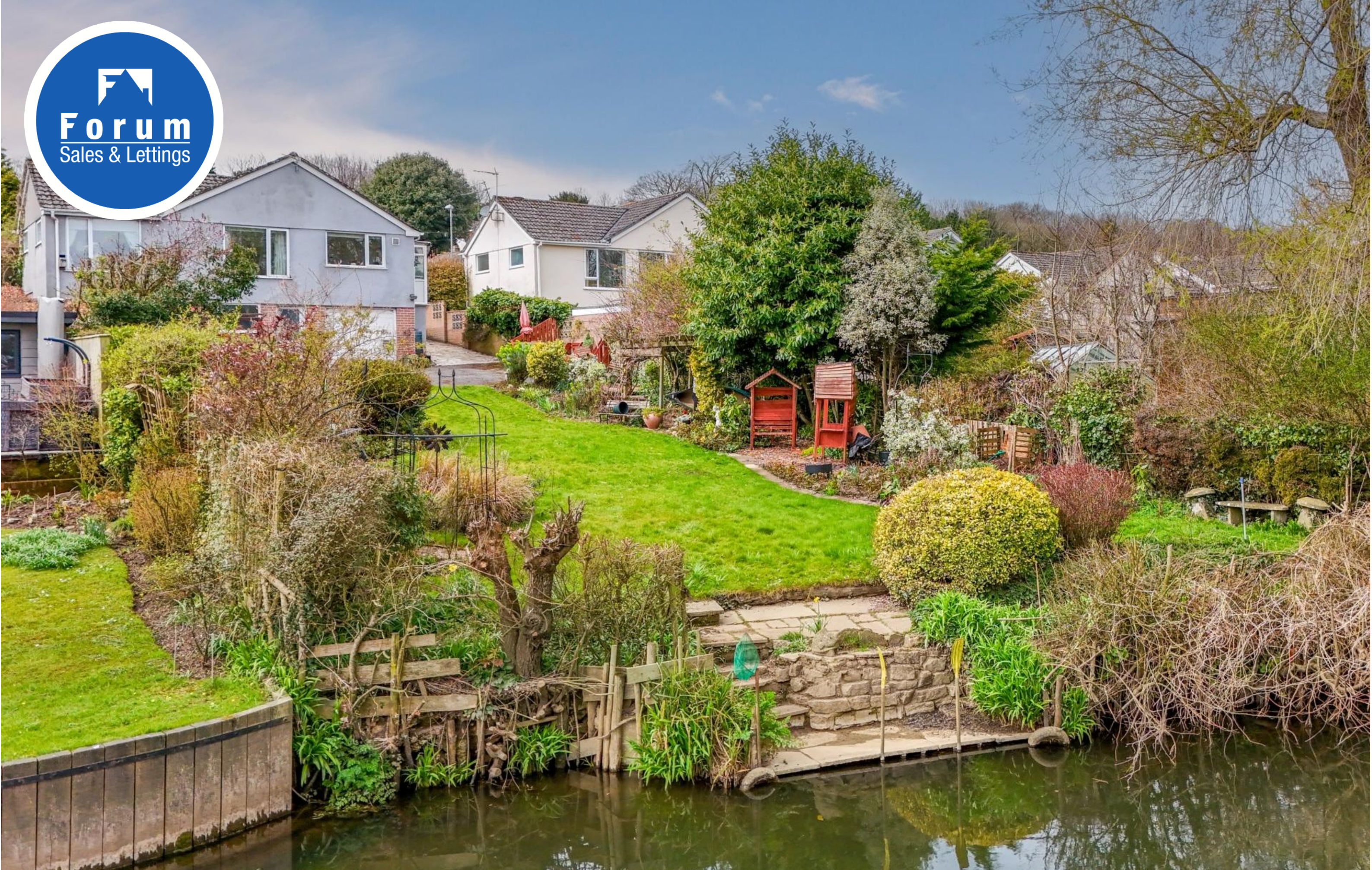
9 Priory Gardens, Spetisbury, Dorset, DT11 9DS