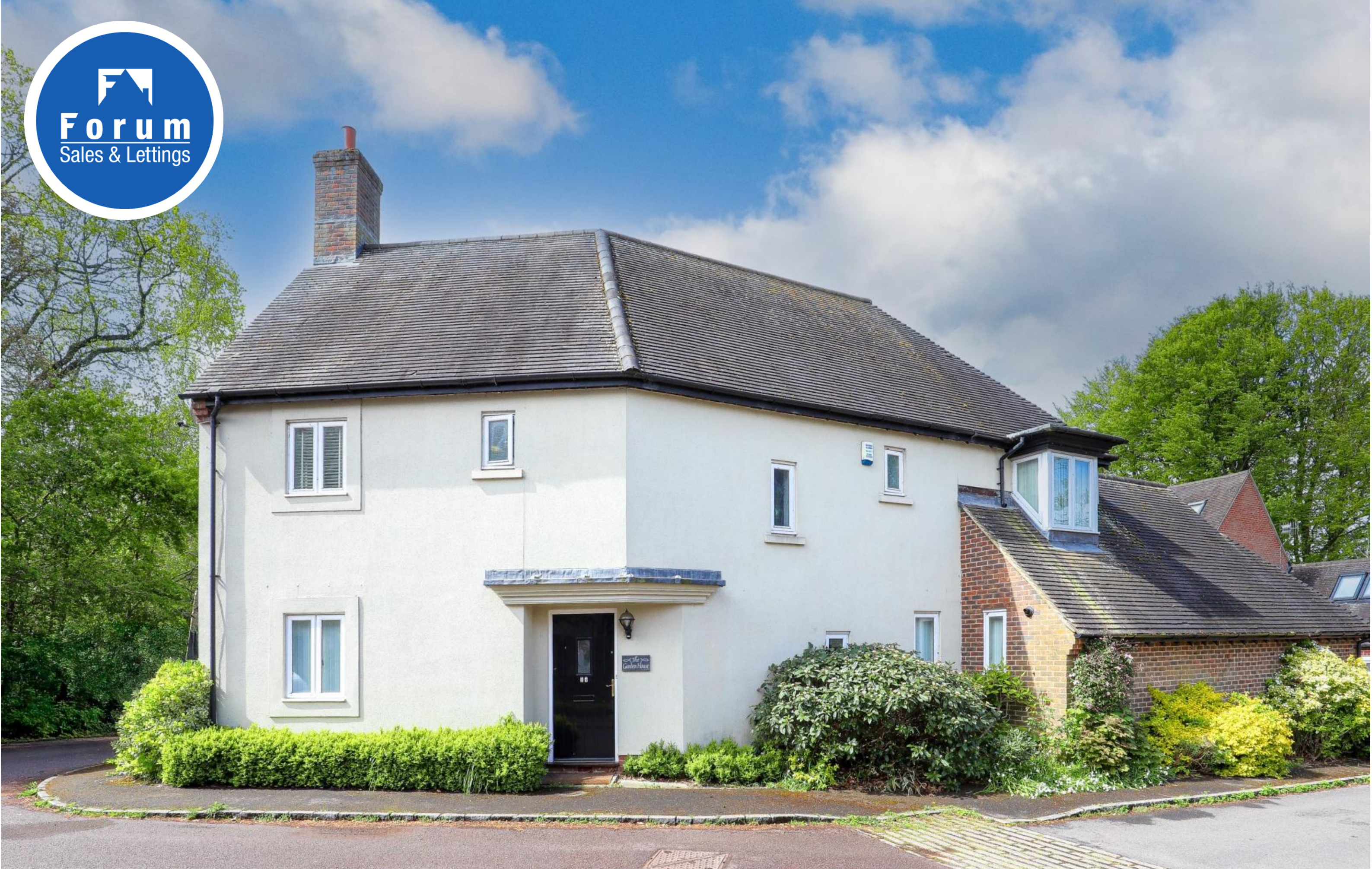
The Garden House, Blandford St Mary, Dorset, DT11 9QL