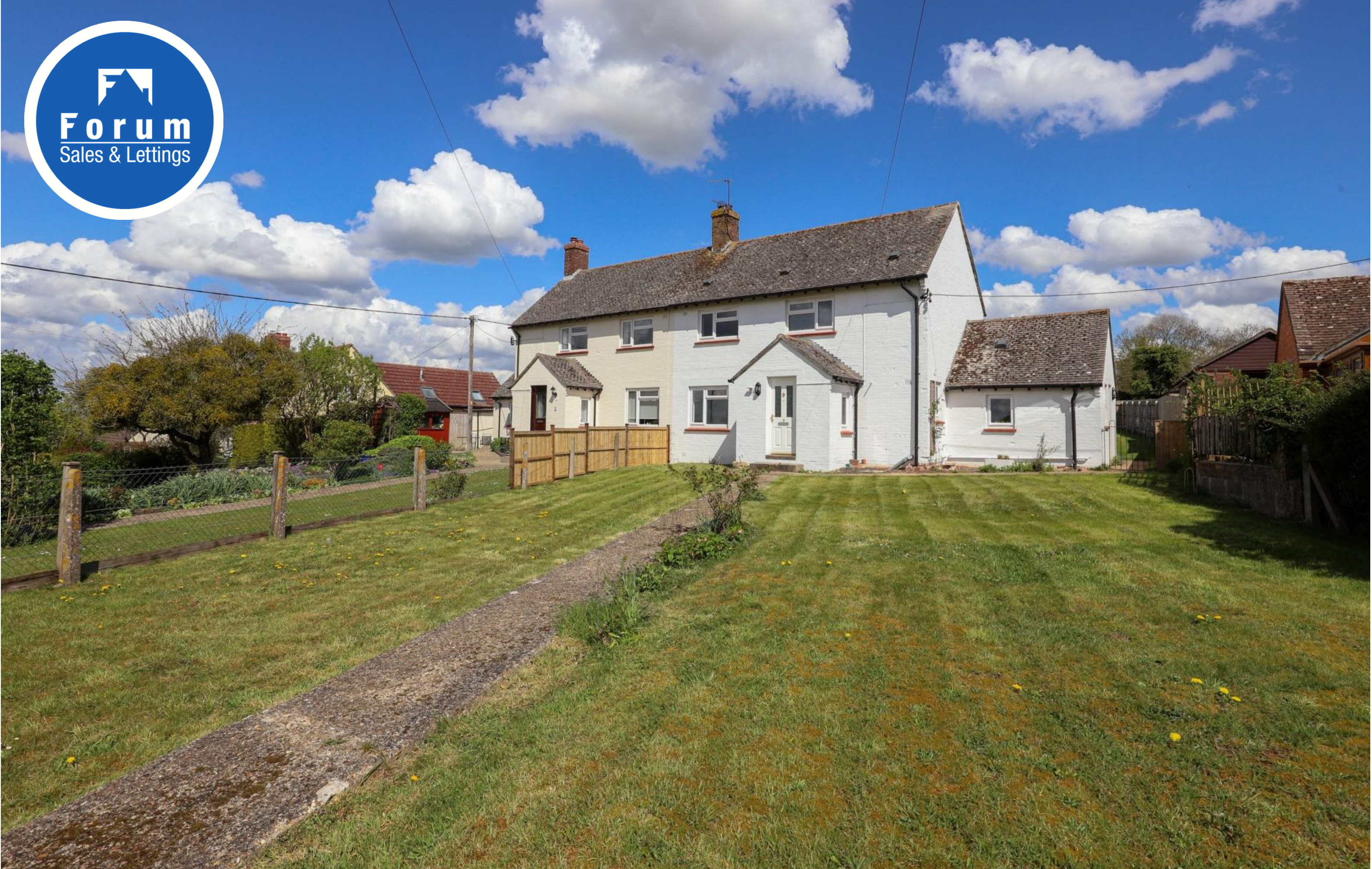
3 Nicholson Cottages, Hinton St Mary, Sturminster Newton, Dorset, DT10 1NF